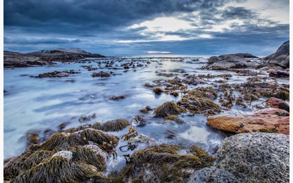
Cathy Bell | False Bay