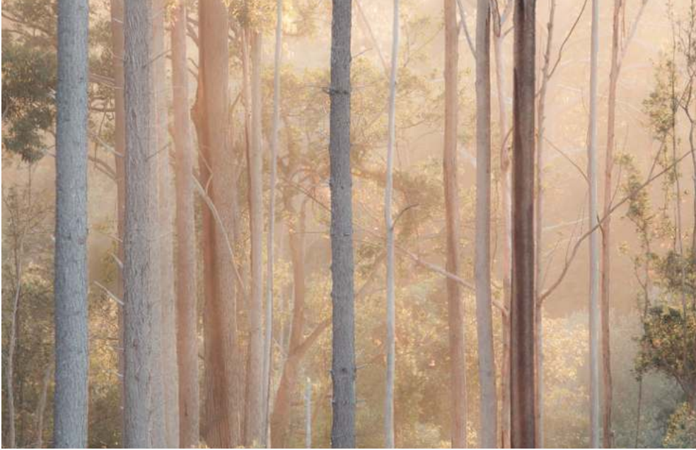
Fumi Hirai | Cecilia forest