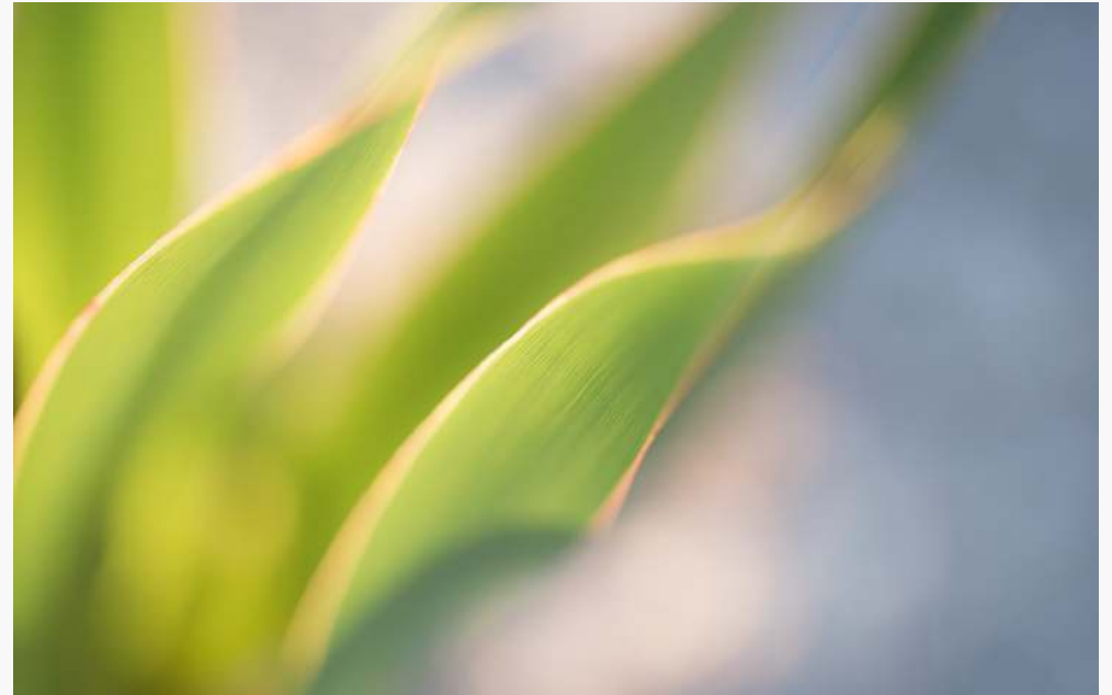
Yana Niewodniczanska | Cape Peninsula