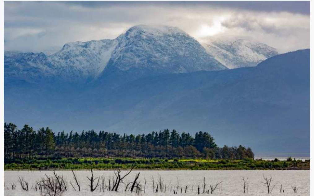
Graham Stapelton | Thee Waters