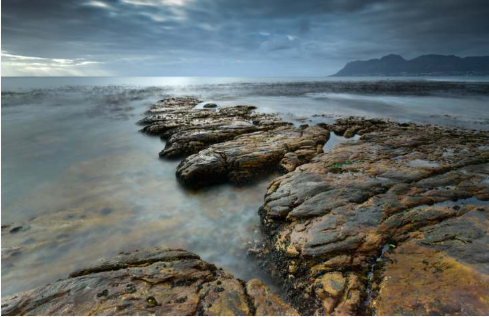
Robin-Larmuth | False Bay