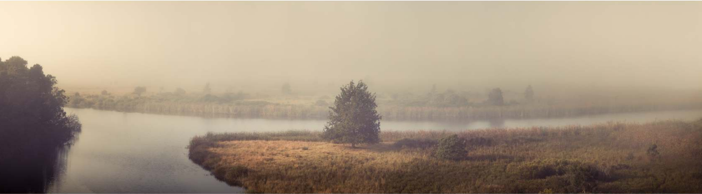
Swellendam - Overberg

This course is specifically presented during winter or at the change of season when lighting conditions are best for outdoor photography. The best way to learn about light and mood is to experience it.