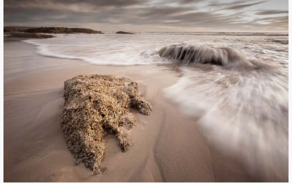
Nolan Lister | Noordhoeks