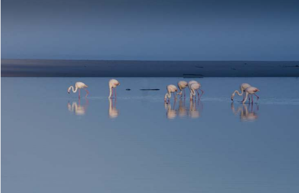
Trisha Owen | Noordhoek